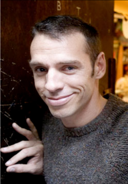
Puppeteer Basil Twist